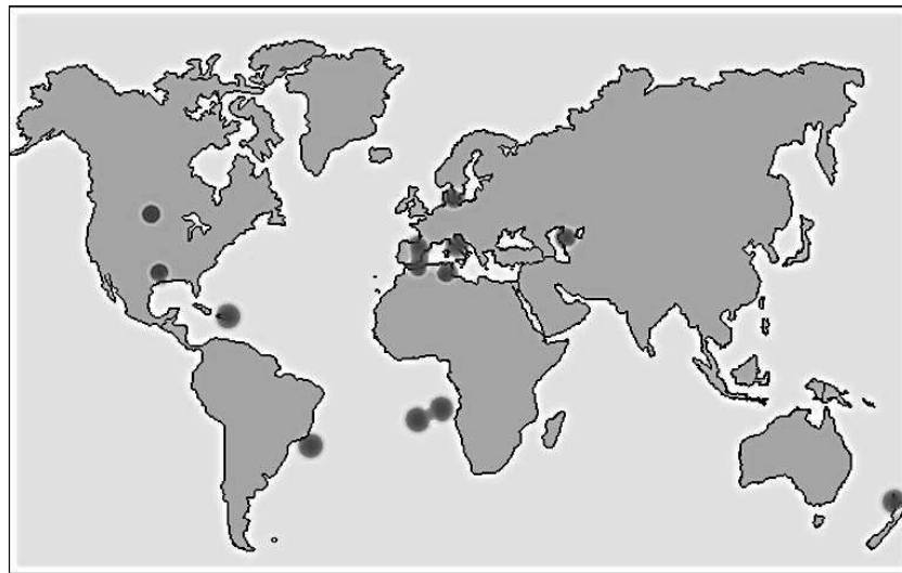
Iridium sites in the world

Layers of the Earth's crust with an increased concentration of carbon and iridium are very rare. Iridium layers are found for example in Denmark, Italy, Spain, Tunisia, Morocco, followed by New Zealand and North America, where the film thickness goes up to 40 centimeters. It is assumed that the appearance of iridium could be due to very poor soil sedimentation in a period when the concentration of iridium, which is constantly in minute quantities falling from space to Earth, was increased. Minor amounts of iridium are found in the ashes from huge volcanic eruptions. The emergence of iridium in the soil, however, is most likely in the cases after impact of falling of a celestial body to Earth, when in extreme conditions they disperse larger amounts of this element. Iridium sites around the Mediterranean Sea (Italy, Spain, Tunisia and Morocco) indicate a strong possibility (probability) of one or more asteroids falling within the Mediterranean iridium circle, that is the space in the Mediterranean Sea .